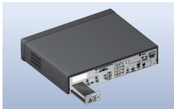
MT2 OTA Module Partially Inserted into Receiver

Review the Over-the-Air Module Installation Instructions.